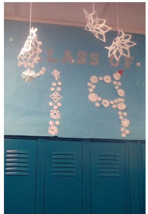
The class of 2019 decorated with snowflakes