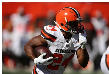
Nick Chubb of the Cleveland Browns.

due to his versatility. He can run the ball very well from the line of scrimmage and excels when receiving dump off passes from the quarterback. He led the league in total scrimmage yards by all rookie running backs and had no fumbles all season. Barkley has not transformed the franchise yet but has been doing an unbelievable job from an individual standpoint.