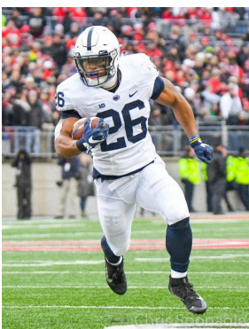
Saquan Barkley in college at Penn State University.

The 2018-2019 NFL season has included an intriguing showcase of rookie talent, especially from the running backs. This season, the rookie sensation Saquan Barkley from the New York Giants has taken the league by storm. Barkley was taken with the 2 nd overall pick because he stood out from the rest of the running backs in the draft