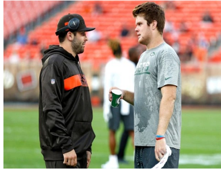
Darnold and Mayfield share a moment on the field pregame

Josh Rosen and Baker Mayfield both became their team's permanent starters in Week 4 after disappointing performances by Sam Bradford and Tyrod Taylor, respectively. Mayfield came into the game right before halftime in Week 3 against the New York Jets and led the Browns to their first win since the 2016 season. "He was so ready for this moment," Browns Receiver Jarvis Landry said.