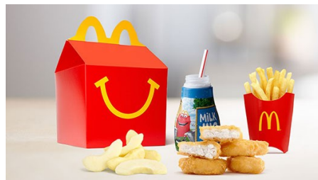
McDonalds Nuggets came in second place