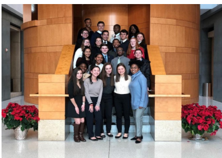
Members of the mock trial team

"We got to sit in on an oral argument, pre-trial motions, and even a sentencing hearing. It was cool seeing professionals do the things that we do using the same structure, with the same problems, in almost the same way. It put everything we do as part of the club into perspective for me. Things that happen every day in court impact individuals and their families for an entire lifetime. We were sitting just