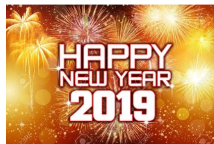
New Year's Picture from wishes. tips

about which direction you might want to take in the future."