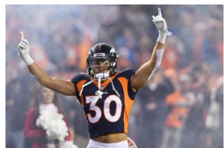
Phillip Lindsey of the Denver Broncos.

There have been many rookie classes that have had talented running backs, but this one in particular stands out.