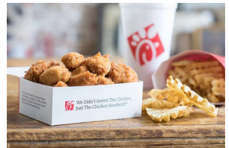
The winning Chick-Fil-A Nuggets

The top three placing restaurants were Chick-Fil-A, McDonalds, and Wendy's. Franklin High students appreciate the variety of restaurants located near the school and the high-quality nuggets they are served.