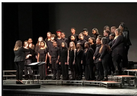
The top chorus group singing to their peers.

The Performing Arts at Franklin High School include: Band, Orchestra, Chorus, Dance, and Theater. On Wednesday, December 19, 2018, the Performing Arts put on a show for all students during third period.