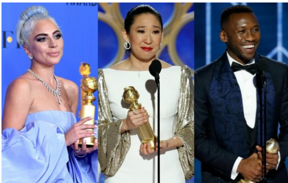
Lady Gaga, Sandra Oh, and Mahershala Ali celebrating after their wins

Some of the winners of the night were Rami Malek for actor in a drama motion picture, "Shallow" from A Star is Born for original song, Darren Criss for actor in a miniseries, Spider-Man Into the Spider-Verse for animated feature, and Rachel Brosnahan, The Marvelous Mrs. Maisel for actress in a television series musical or comedy.